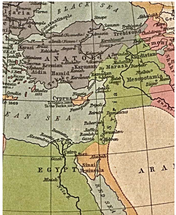
Ottoman Empire 1481—1683 — A small section —

For the second month in a row, the Internet Picture of the Month selection is a map. This map is from the University of Texas's Historical Map Collection for the Middle East at http://www.lib.utexas.edu/maps/historical/history_middle_east.html . The different colors indicate when the regions became part of the empire. What is of interest is that on this map there is no Iraq, no Lebanon, no Israel. These countries came into existence after WWI.