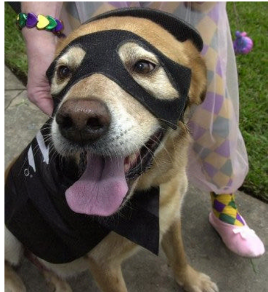
Mardi Gras Dog

One of the many photos taken in New Orleans this Mardi Gras was of "Baby Dog" at the Krewe of Grela parade in Gretna by a New Orleans Times-Picayune photographer.