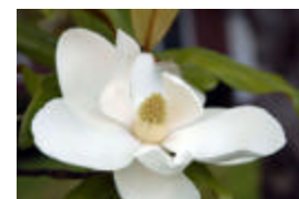
June in Tampa Magnolia

A Monthly Publication of the Tampa PC Users Group, Inc.