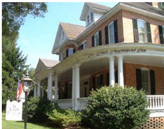
The Lords Proprietors' Inn

The Lords Proprietors' Inn comprises three restored homes on over an acre of grounds in the Historic District of Edenton, NC.