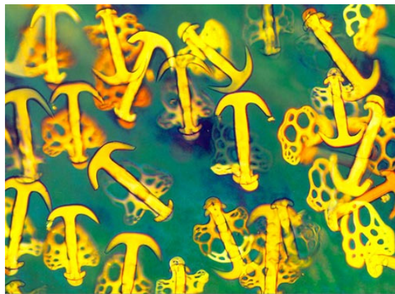
Synapta sp. (medusa worm) skin (100x)

Nikon Small World 2000 Competition Winner, Second Place, 2000 Competition, Christian Gautier, PHO.N.E. Photo Agency, Paris, France.